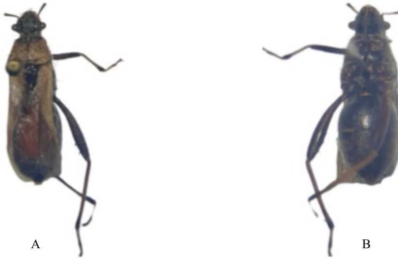
Figure 1. Alydus calcaratus A) dorsal view B) ventral view