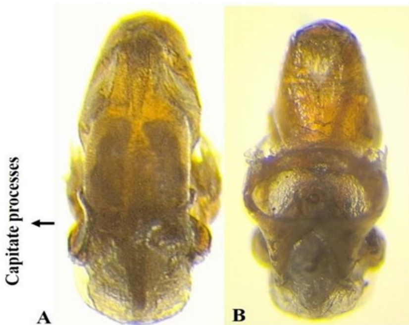
Figure 4. Aedeagus structure of Alydus calcaratus A) Ventral view; B) Dorsal view.

Parameres: The paramere structure generally transversely elongate and slightly curved laterally. In the image, particularly the crown region (including the apical process and laminate lobe) distinct. The apical process curved and ends in a bluntly truncate form, slightly directed upward. The surface exhibits distinct laminar reflections and smooth brightness, suggesting that it rich in micro-sculpture. The laminate lobe appears as a broad, flattened connecting structure linking the apical process with the main body of the paramere. From the anterior view, this lobe forms a distinct bridge-like structure, defining the overall C-shaped appearance of the paramere. (Figure 3) Overall, the structure shows a strong curvature and a clearly developed lamination in the crown region. This appearance represents a position in which the asymmetry at the apical portion of the paramere particularly the difference in inclination of the apical projection clearly visible.