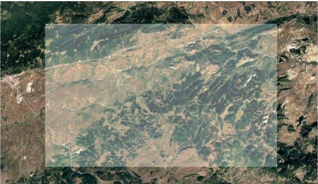
Figure 1. Study area (grey pattern) within the borders of the Gerede district of Bolu province

For the identification of the species, relevant literature (Aysev, 1974; Kerzner, 1964; Pehlivan, 1981; Stichel, 1956-62; Wagner, 1970-1971) and comparative materials were used. The distribution of the species in Bolu (Türkiye) was compiled from the literature of Önder et al., (2006), Hoberlandt (1955). The material is stored in Gazi University Faculty of Science Prof. Dr. Metin Aktaş Zoology Museum.